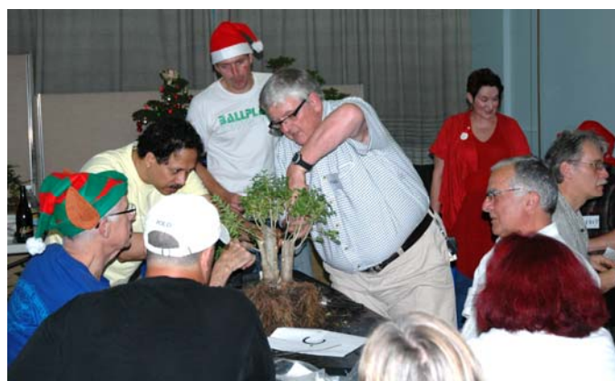
Team C all concentrating on their tree