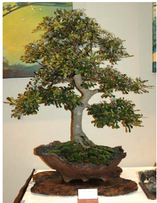
Banksia integrifolia bonsai

The symposium will consist of a Q and A session with a panel of experienced Australian bonsai artists, a presentation on some Australian species suitable for bonsai, a workshop each day on styling several species and a guided walk in the Australian National Botanic Gardens to observe native trees growing in their more natural style and to consider this form as a bonsai.