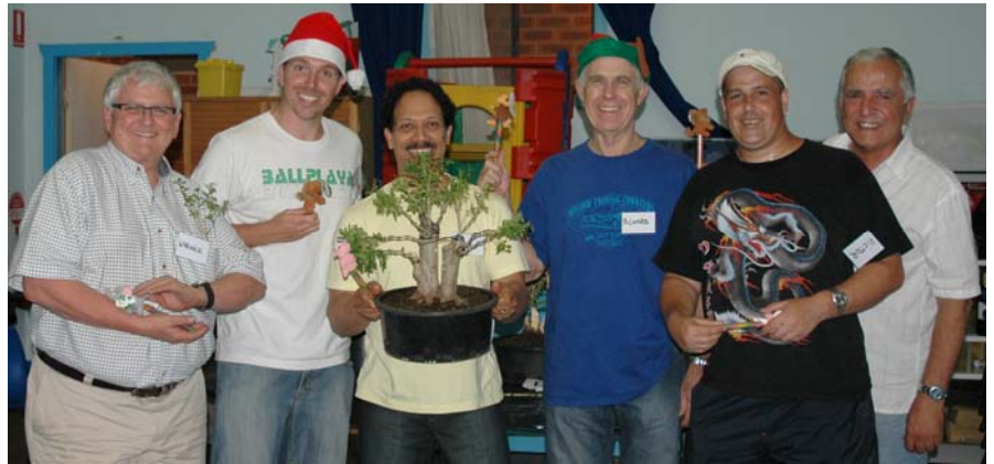
The winners of the December meeting team styling of Small Leaf Privets – Congratulations!

Sue to demonstrate "cutting a fig in half" & workshop - Pruning figs, lillipillies, junipers, privets, olives, natives