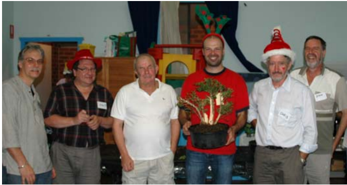
Team B took second place