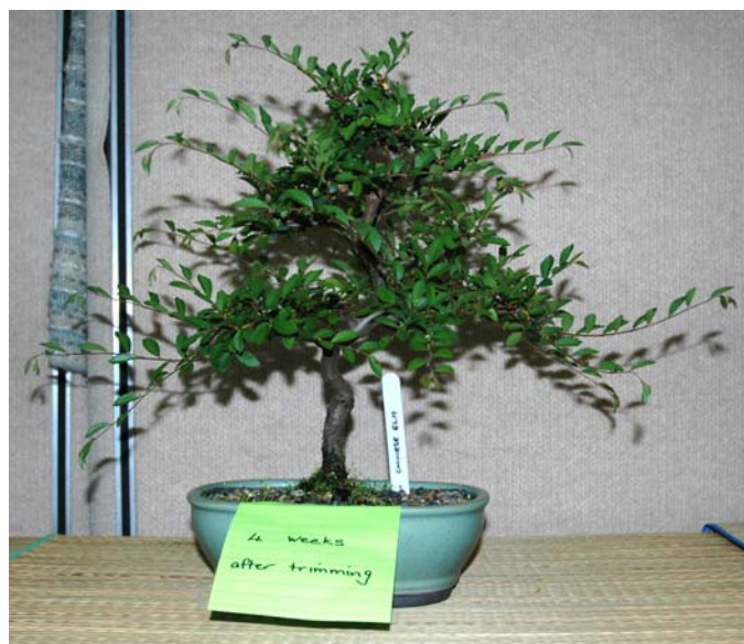
The same Elm one month later