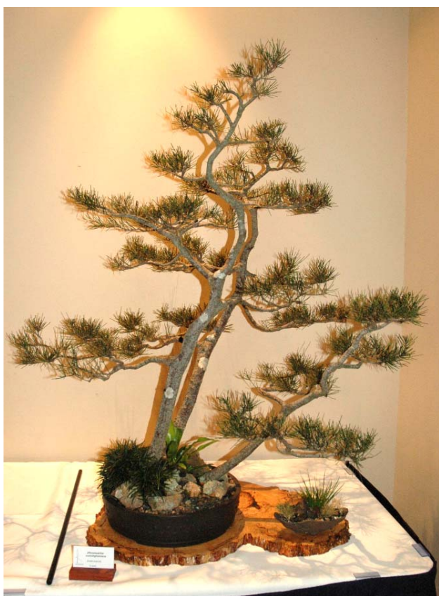
Allocasuarina cunninghamiana bonsai

There is a $30 registration fee for the event plus a fee of $15 for workshop participants and $5 for observers at workshops. Australian native bonsai stock trees can be provided for workshop participants at prices between $36 and $75, depending on species and size.