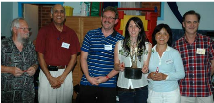
Team A in third place