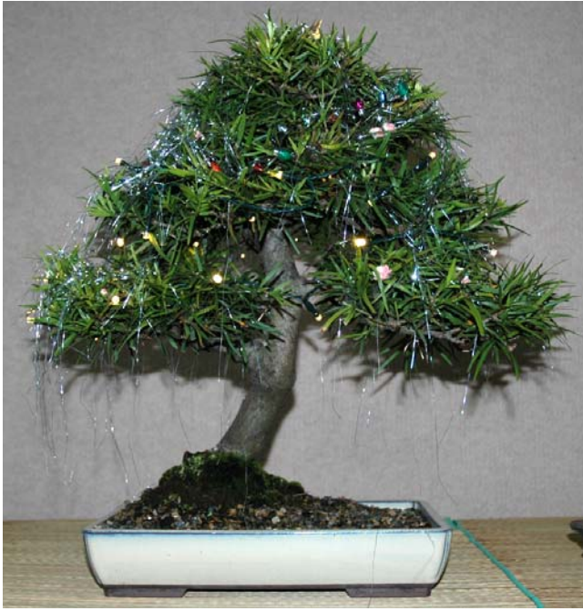
Sue's Podcarpus bonsai in glittering style for Christmas