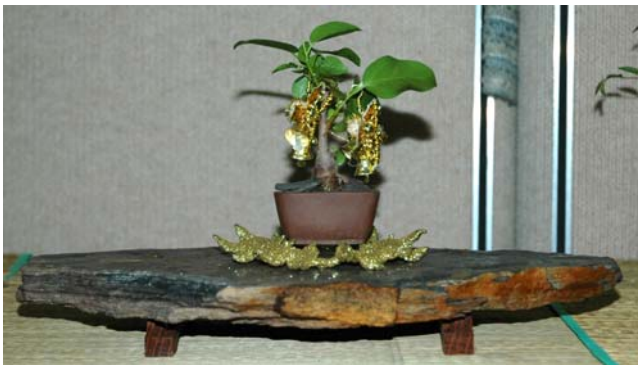
Chris's tiny fig almost looks like it is wearing earrings!