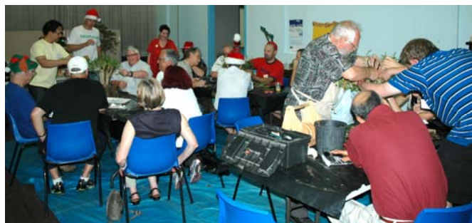
Team Styling in full swing