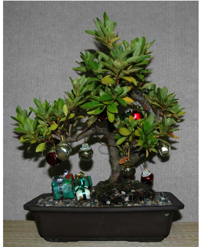
This little Azalea bonsai got presents!