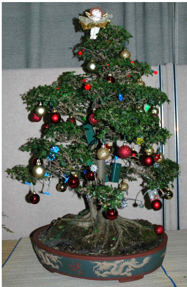
Peter's Privet bonsai sparkling with decorations