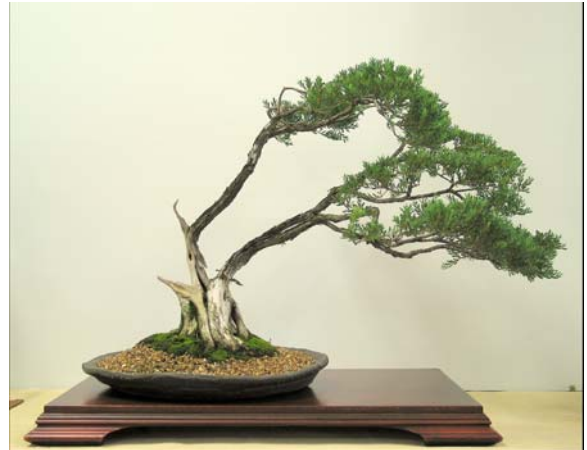
Melaleuca thymifolia : Ray Nesci, 2006

The symposium will be conducted under the umbrella of the annual National Exhibition of Australian Native Plants as Bonsai held in conjunction with the Australian National Botanic Gardens (ANBG).