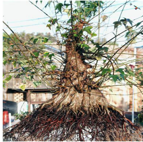
Tree when removed from the ground