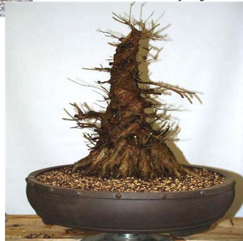
Potted up, permanent branch selection & development is next..