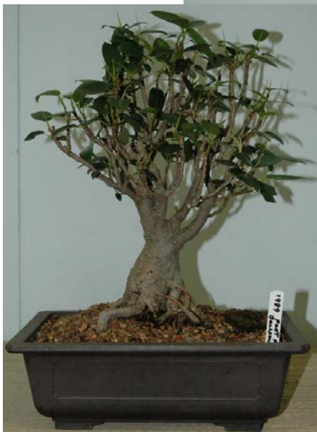
Grahame Bates' Ficus rubiginosa Port Jackson Fig