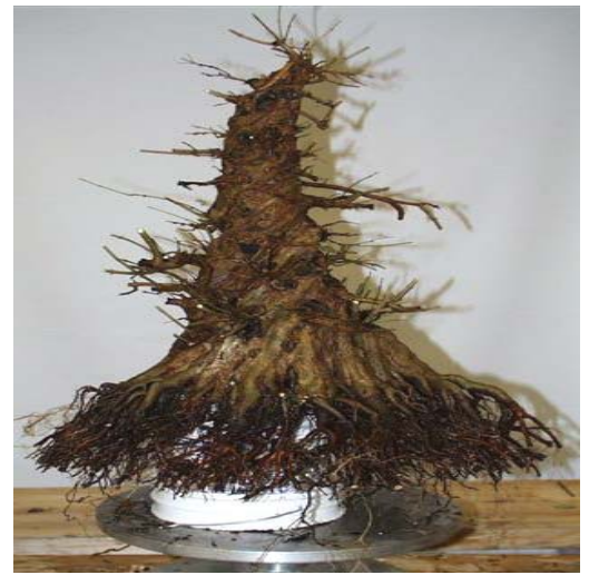
Trimmed ready to go into a bonsai pot