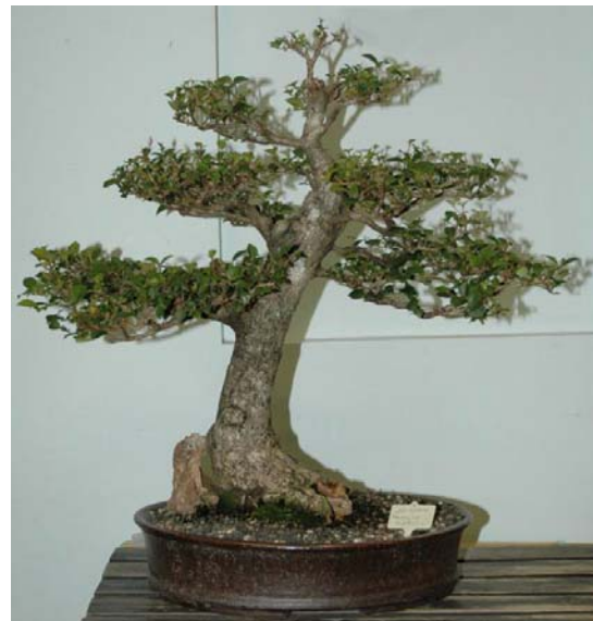
Neville Althaus's Backhousia myrtifolia Gray Myrtle