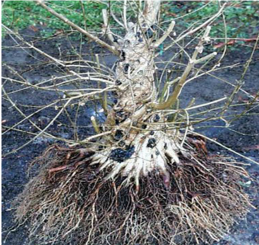
Seedlings fusing together, sacrifice branches retained to speed up fusing of the trunks