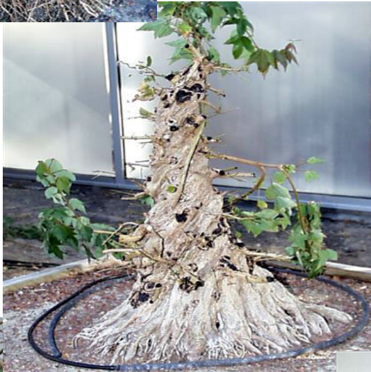
More sacrifice branches removed, fusing of trunks going well, root system also forming up well.