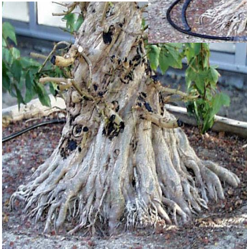
Close up of root development