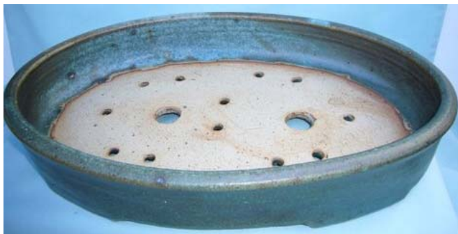
Blue glazed pot showing tie holes

At this stage of her developing bonsai pottery career, Penny will do special orders for particular pot sizes and and/or finishes.