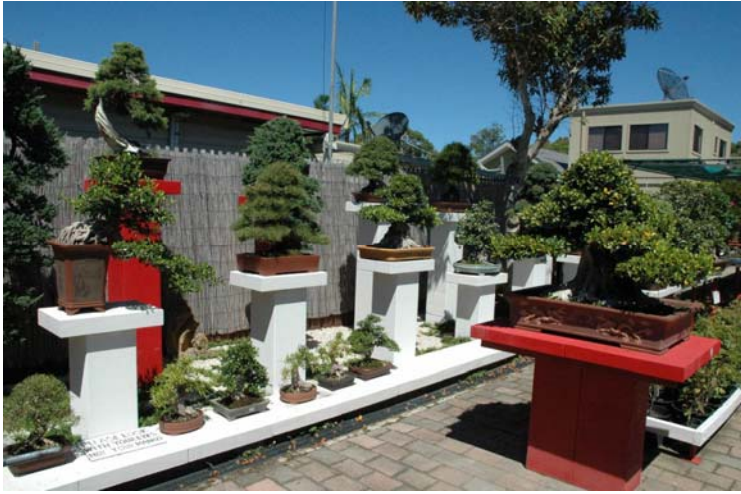
↑ Bonsai South Nursery main display area

Bonsai South Nursery is a beautiful nursery and Sue & Leon Kwong are kindly hosts. We were all made welcome and offered chilled water against the heat of the day – the hospitality and water were both much appreciated.