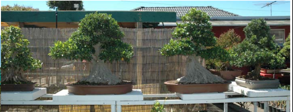
↑ Magnificent Ficus bonsai on display