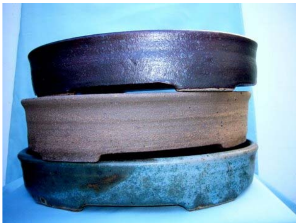
Three oval pots