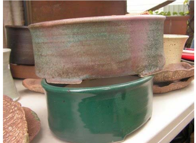
Deep glazed pot

A For this it would be best to take a run up to Toronto with the plant to ensure the best outcome.