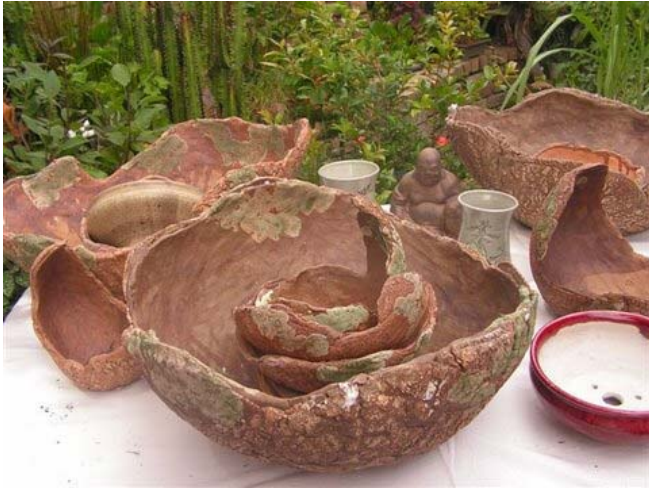
Mixed range of Lichen Pots