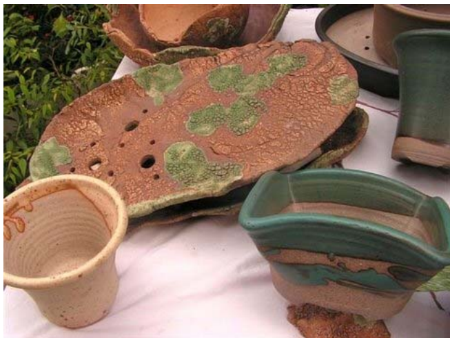
Four styles of Mudlark pots