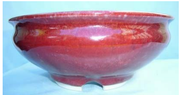
Red glazed pot

Penny is one of the few potters using a copper glaze that produces a rich blue tinged red glaze. The glaze is a colloidal colour that is hard to handle because it depends how the light hits it and refracts so it has to be applied thickly to get the depth of colour needed. Then it can run off the pot and the bottom needs to be scraped. But a well glazed red pot is well worth the trouble – to the user at least.